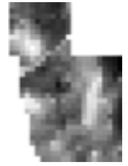
Area of resistivity survey of mound